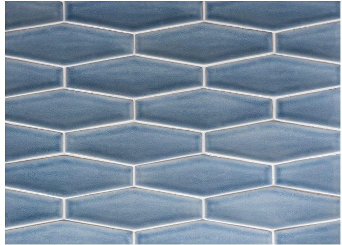
TONAL VARIATION WITH LIGHT & DARK TILE

Make sure your installer reads our installation instructions thoroughly to achieve the best look.