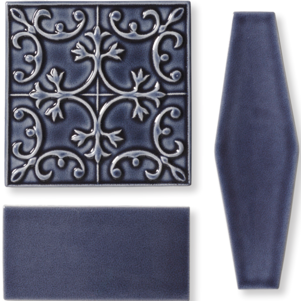
ALL PIECES SHOWN IN FONTAINEBLEAU (CLOCKWISE) LA VIE, TRESTLE, 3X6

Add-on orders are challenging due to the inherent variation from batch to batch. If you have to order more at a later date, it will vary slightly from your original order.