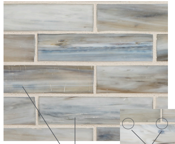
SURFACE FOLDS, SHALLOW CRACKS & CHIPS

The surface will collect grout during the grouting process. The amount of grout visible after installation will depend primarily on the contrast between the grout color and tile color, how well the tiles were cleaned before/after grouting, and viewing distance. Make sure your installer reads our installation instructions thoroughly to achieve the best look.