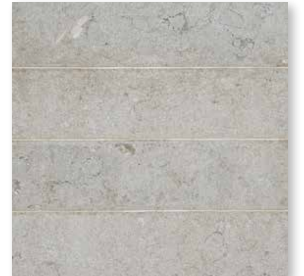
PORTO LIMESTONE : TEXTURED 3 x 6 | 3 x 12 | 6 x 12 | 12 x 12 | 12 x 24

ALL SONOMA STONES HAVE NATURAL VARIATION IN COLOR AND MOVEMENT. NO TWO PIECES ARE EXACTLY ALIKE. PLEASE REFERENCE CURRENT SAMPLES.