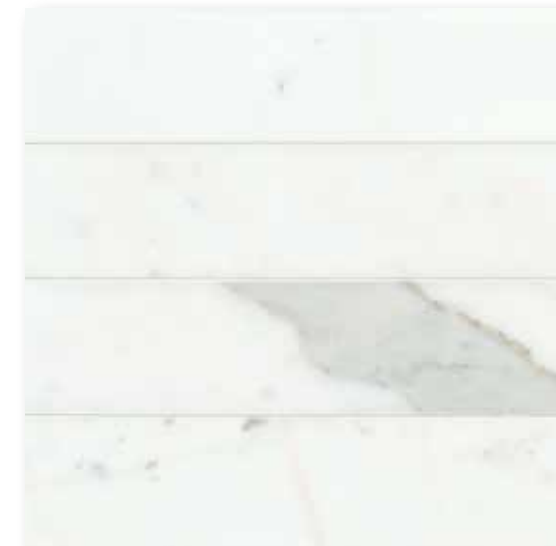
ARAMIS MARBLE : HONED 3 x 6 | 3 x 12 | 6 x 12 | 12 x 12

ALL SONOMA STONES HAVE NATURAL VARIATION IN COLOR AND MOVEMENT. NO TWO PIECES ARE EXACTLY ALIKE. PLEASE REFERENCE CURRENT SAMPLES.