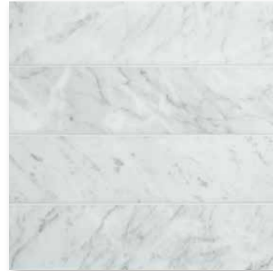
CAVALLI MARBLE : HONED 3 x 6 | 3 x 12 | 6 x 12 | 12 x 12 | 12 x 24 | 3D BARNETT 6 x 24