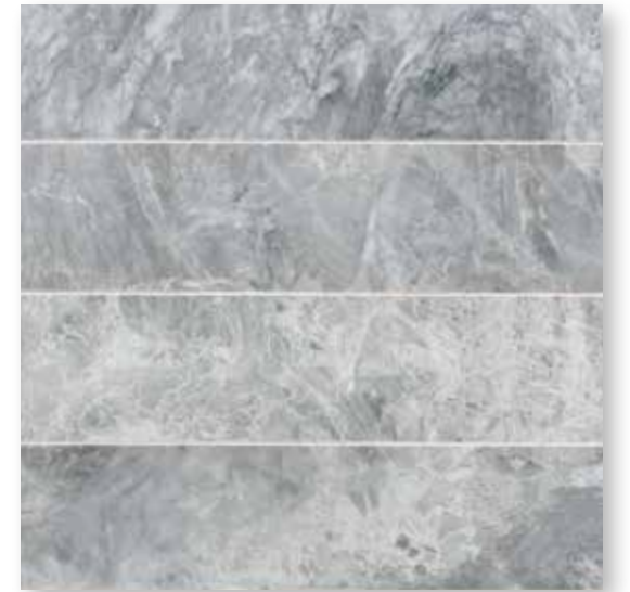
BELLEVUE MARBLE : HONED 3 x 6 | 3 x 12 | 6 x 12 | 12 x 12 | 3D BARNETT 6 x 24