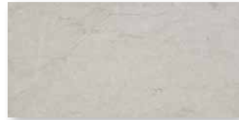
6 x 12 FIELD