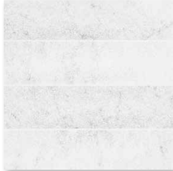
CHENILLE MARBLE : TEXTURED 3 x 6 | 3 x 12 | 6 x 12 | 12 x 12 | 12 x 24