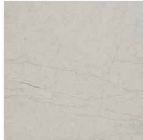
12 x 12 FIELD