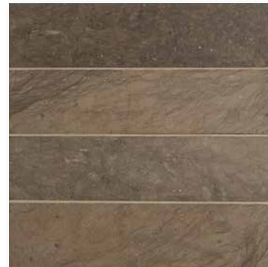
TEAKWOOD LIMESTONE : HONED 3 x 6 | 3 x 12 | 6 x 12 | 12 x 12