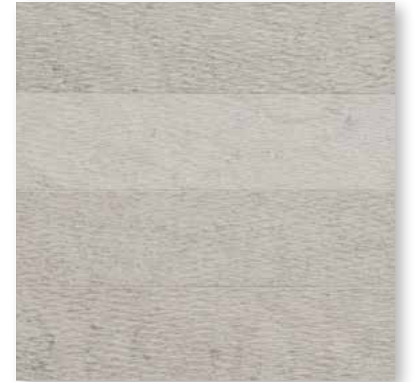
QUADRATA LIMESTONE : TEXTURED 3 x 6 | 3 x 12 | 6 x 12 | 12 x 12 | 12 x 24