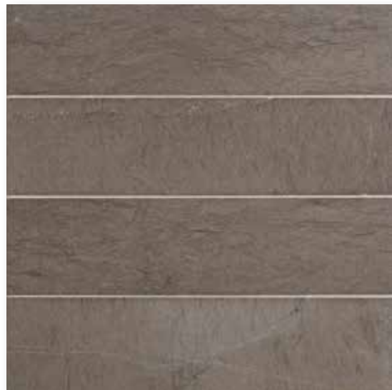
GRAY FLANNEL LIMESTONE : HONED 3 x 6 | 3 x 12 | 6 x 12 | 12 x 12

ALL SONOMA STONES HAVE NATURAL VARIATION IN COLOR AND MOVEMENT. NO TWO PIECES ARE EXACTLY ALIKE. PLEASE REFERENCE CURRENT SAMPLES.