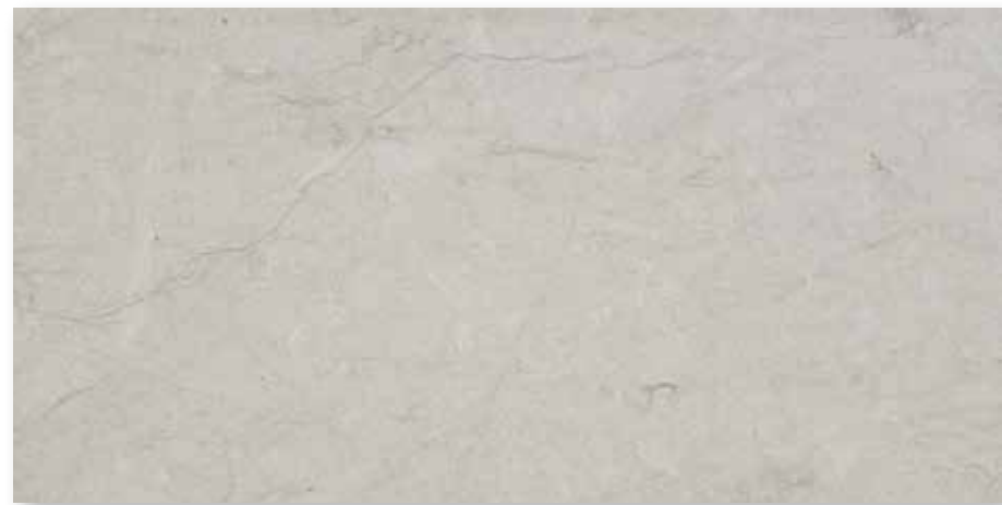
12 x 24 FIELD

Available in select stones. See chart next page.