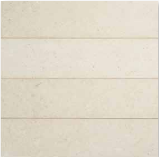
CASHMERE LIMESTONE : HONED 3 x 6 | 3 x 12 | 6 x 12 | 12 x 12 | 12 x 24