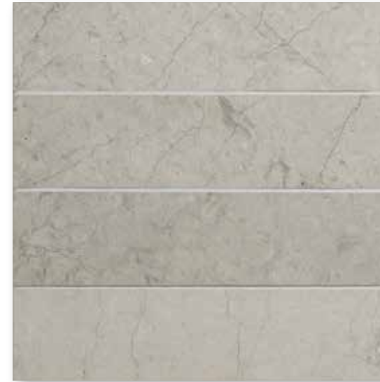
PIANA LIMESTONE : HONED 3 x 6 | 3 x 12 | 6 x 12 | 12 x 12 | 12 x 24