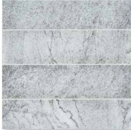
BEL CANTO MARBLE : TEXTURED 3 x 6 | 3 x 12 | 6 x 12 | 12 x 12 | 12 x 24