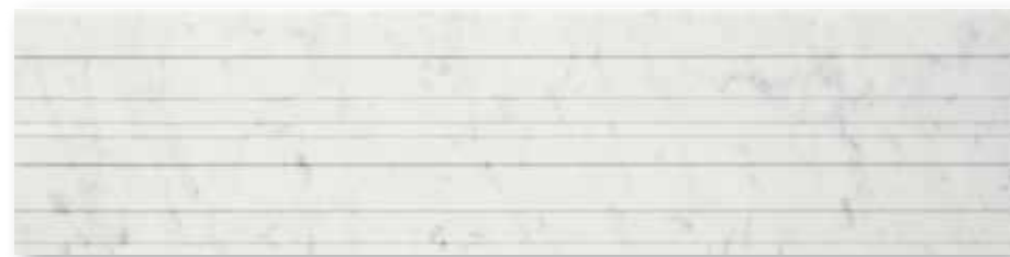
6 x 24 | 3D BARNETT

Available in select stones. See chart next page.