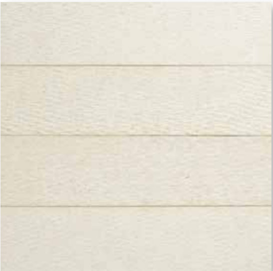
JUTE LIMESTONE : TEXTURED 3 x 6 | 3 x 12 | 6 x 12 | 12 x 12 | 12 x 24

ALL SONOMA STONES HAVE NATURAL VARIATION IN COLOR AND MOVEMENT. NO TWO PIECES ARE EXACTLY ALIKE. PLEASE REFERENCE CURRENT SAMPLES.