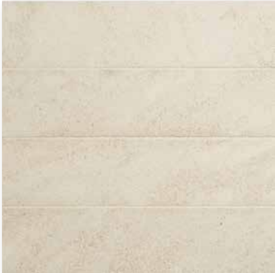
CHAUMONT LIMESTONE : HONED 3 x 6 | 3 x 12 | 6 x 12 | 12 x 12